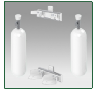
Holder for 2 Medical Gas Bottle Vertical Rail Mounting Part Number: 999.173