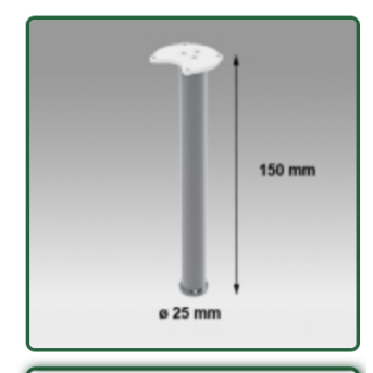
15 cm bottom pole for height adjustable monitor arms Part Number: 988.102