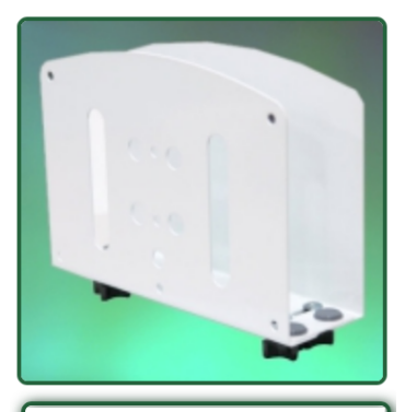
UC Holder for Medical Arm Combo H Class WT Wall Mount Part Number: 112.001