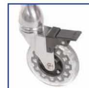
Ergonoflex Part Number: EGF 01816 Medical Cart Option Oversized Casters