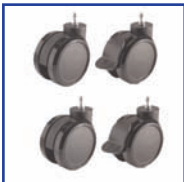
Ergonoflex Part Number: EGF 01830 Medical Cart Option Dual Heavy Duty Casters