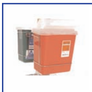
Ergonoflex Part Number: EGF 01808 Medical Cart Option Sharps Container