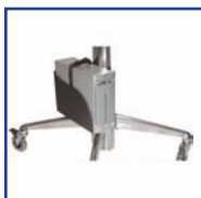
Ergonoflex Part Number: EGF 01810 Medical Cart Option Slim Line CPU Holder