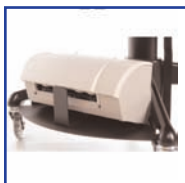
Ergonoflex Part Number: EGF 01812 Medical Cart Option Multi Purpose Shelf