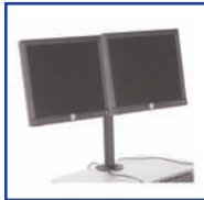
Ergonoflex Part Number: EGF 01826 Medical Cart Option Dual Flat Screen Monitor Arm