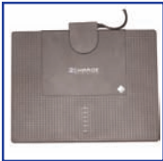
Ergonoflex Part Number: EGF 01820 Medical Cart Option External Battery for Laptop Autonomy 8/10 hours