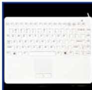
Ergonoflex Part Number: EGF 05702 Medical Cart Option Hygienic Medical Keyboard Slim Cool + Color: White-Grey