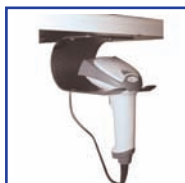
Ergonoflex Part Number: EGF 01801 Medical Cart Option Bar Code Holder