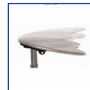
Ergonoflex Part Number: EGF 01814 Medical Cart Option Tilt Option for Worksurface