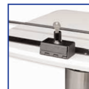
Ergonoflex Part Number: EGF 01818 Medical Cart Option Security Laptop