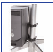
Ergonoflex Part Number: EGF 01809 Medical Cart Option CPU Holder