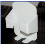
Ergonoflex Part Number: EGF 01822 Medical Cart Option Mouse Pouch