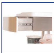
Ergonoflex Part Number: EGF 01806 Medical Cart Option Stainless Steel Security Drawer