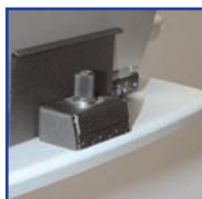
Ergonoflex Part Number: EGF 01804 Medical Cart Option Laptop Screen Support