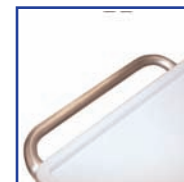
Ergonoflex Part Number: EGF 01815 Medical Cart Option Stainless Steel Cart Handle