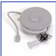
Ergonoflex Part Number: EGF 01824 Medical Cart Option Automatic Retractable Reel Cord with Tripp Lite Power Distribution