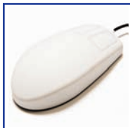
Ergonoflex Part Number: EGF 05302 Medical Cart Option Hygienic Medical Mighty Mouse Color: White-Grey