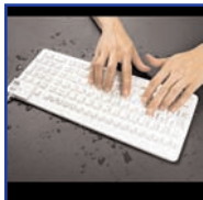
Ergonoflex Part Number: EGF 05202 Medical Cart Option Hygienic Medical Keyboard Really Cool Color: White-Grey