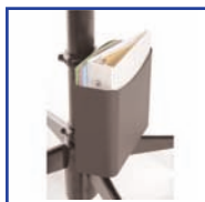
Ergonoflex Part Number: EGF 01803 Medical Cart Option Utility Baxket