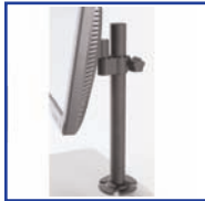
Ergonoflex Part Number: EGF 01825 Medical Cart Option Flat Screen Monitor Arm