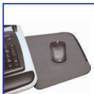
Ergonoflex Part Number: EGF 01802 Medical Cart Option Swing a mouse