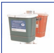
Ergonoflex Part Number: EGF 01807 Medical Cart Option Environmental Container