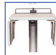
Ergonoflex Part Number: EGF 01813 Medical Cart Option Flip Up Worksurface Extension