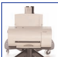
Ergonoflex Part Number: EGF 01811 Medical Cart Option Multi Purpose Shelf