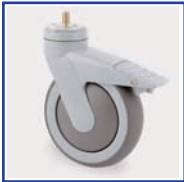
Ergonoflex Part Number: EGF 01828 Medical Cart Option Heavy Duty Casters