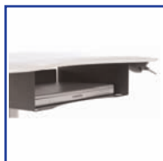
Ergonoflex Part Number: EGF 01805 Medical Cart Option Chart Pocket